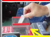
Cash feed port

Put the boarding ticket and fare into the fare box