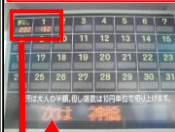
Next bus stop