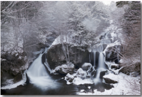
Ryuzu Falls (1-minute walk from 37Ryuzu no taki)