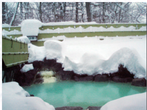
Nikko Astraea Hotel "Open-air bath in snow"