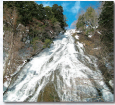
Yutaki Falls (5-minute walk from 44Yutaki Iriguchi)