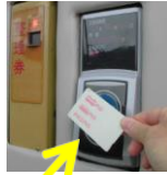
IC card reader