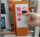
Boarding ticket sample