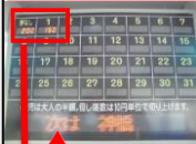
Next bus stop