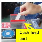
Cash feed port

Put the boarding ticket and fare into the fare box